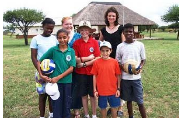
A winning volleyball team! Made up of students from four different countries

Our goal was to exchange ideas and learn from one another; to further that end, the NAIS students prepared to teach our children how to play volleyball, and the Jabulane students in turn prepared a craft of making an Ndebele house, on which they all worked together.